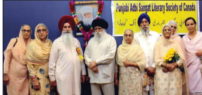
The august gathering present at the function.